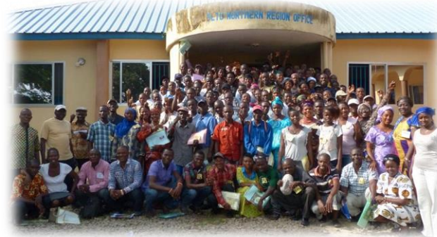
PO 2014 in Sierra Leone