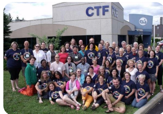
PO 2014 Participants

Orientation dealt with all these items as we watched travel advisories change, then lift with regard to Uganda, and discussed the nature and prevention of Chikungunya and Ebola. As well, we engaged in team building, assignment preparation, intercultural skills building, disaster preparedness, conflict resolution and a host of other topics in preparation for the placements overseas. This year, almost half of the Team Leaders were new to the role, and they all proved to be up to the challenge. As teams left for their destinations, there were the inevitable flight changes and delays, but no difficulties that could not be easily handled using the ever necessary "PO flexibility"!